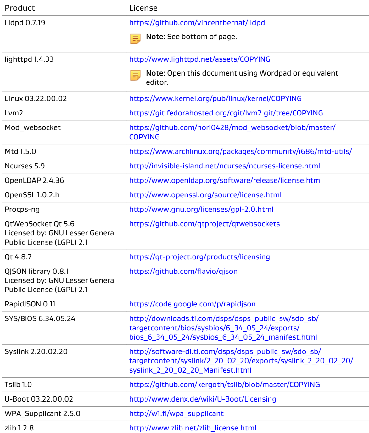
Table 2: Open source software (continued)